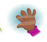
A Breeze On Your Hands