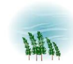
Wind In The Trees