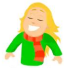
Sunshine On Your Face